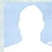
TO BE APPOINTED Old Deer Park